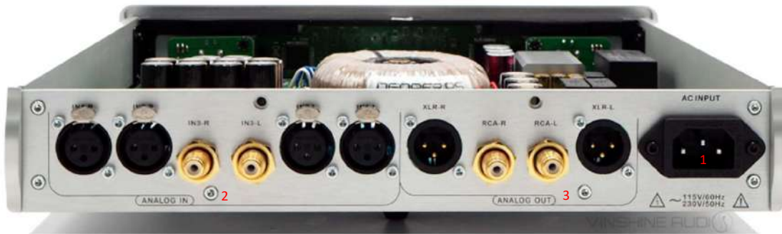
Figure 2. Rear Panel