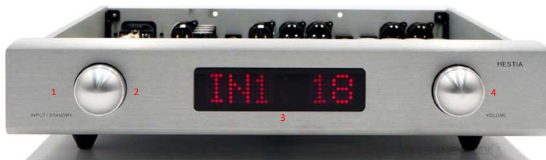
Figure 1. Front Panel